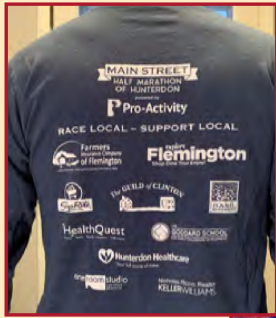
Your Brand on RACE SWAG

Some of the ways we partner with your brand to give you the support your commitment deserves.