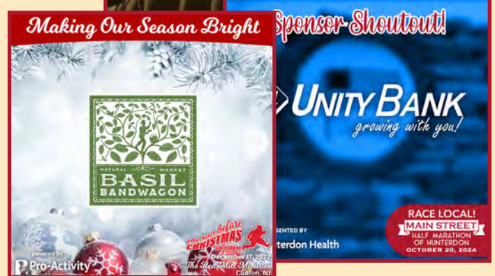
SOCIAL MEDIA MENTIONS, including dedicated or shared post spots and re-shares of your own content with endorsements