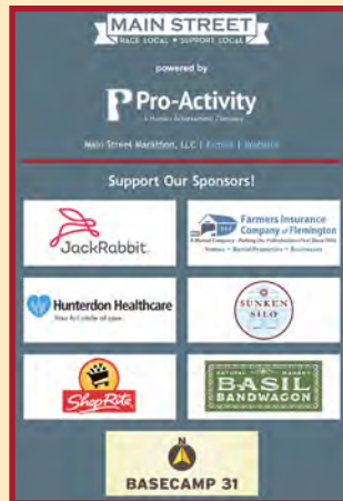
E-NEWSLETTER PLACEMENT with clickable links