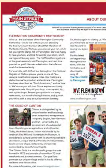
EVENT GUIDE Advertorial Content