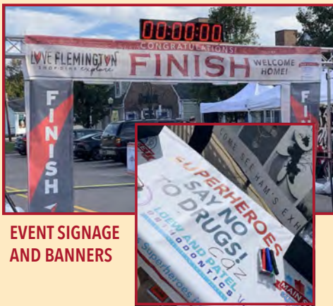
EVENT SIGNAGE AND BANNERS